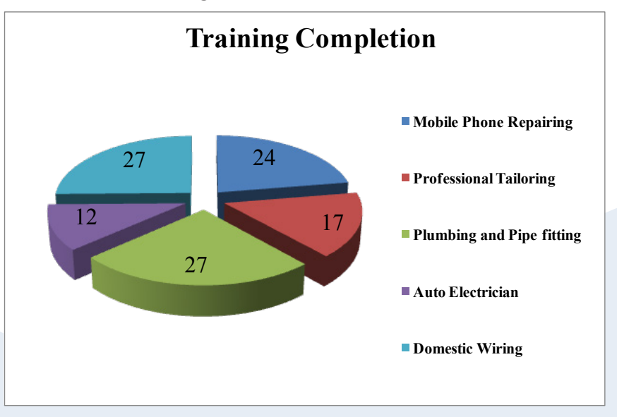
Figure 1: Trade Wise Number of Trainees/Shagird